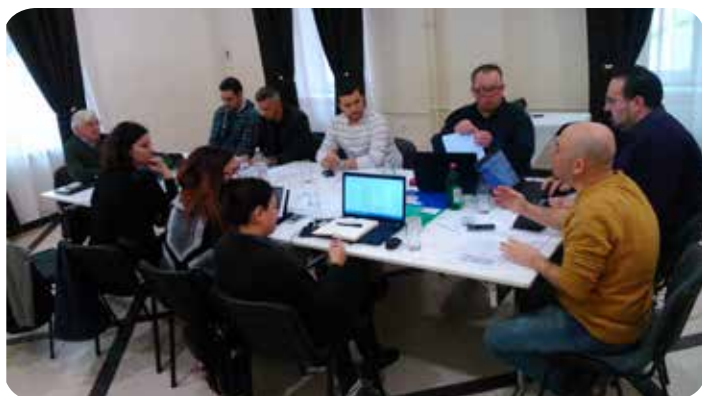
DPNSEE Board Meeting in Belgrade, Serbia