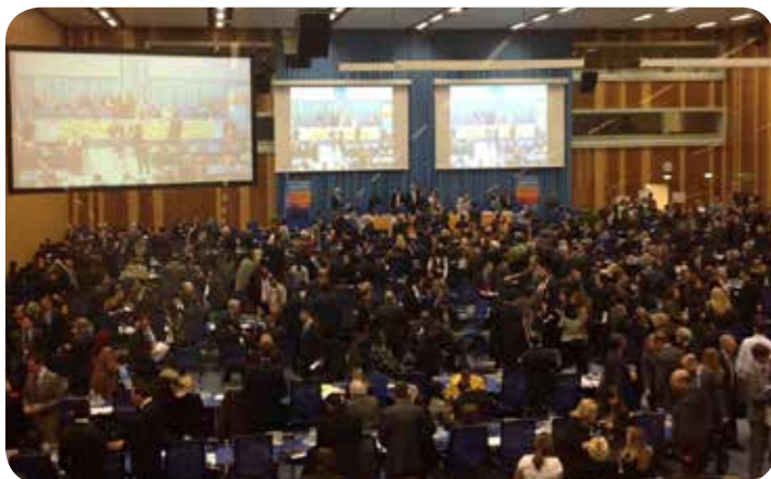
Vienna 59th Commission on Narcotic Drugs (CND)