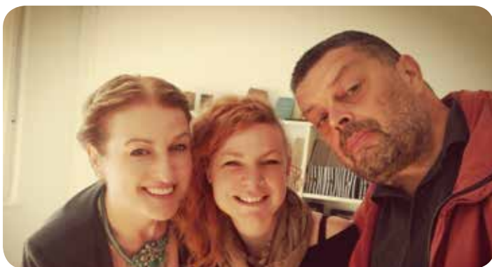
DPNSEE Office in Belgrade established!