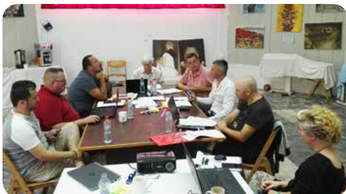
DPNSEE Board Meeting in Ohrid