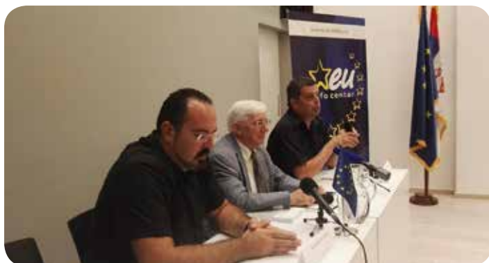
Press conference, EU info centre