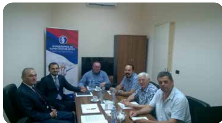
Visit to Serbia Good visit at the right time