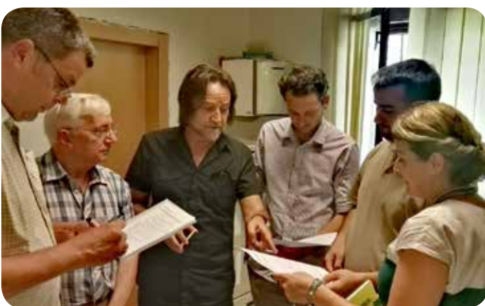
Visit to Kosovo A promising visit to challenging area