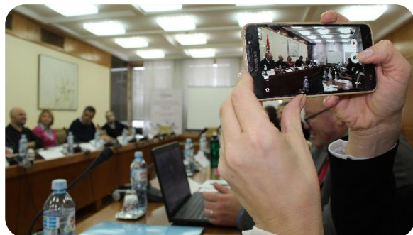
The DPNSEE General Assembly