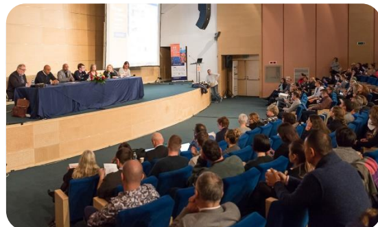
European Harm Reduction Conference