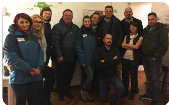
Situation in Romania is full of challenges